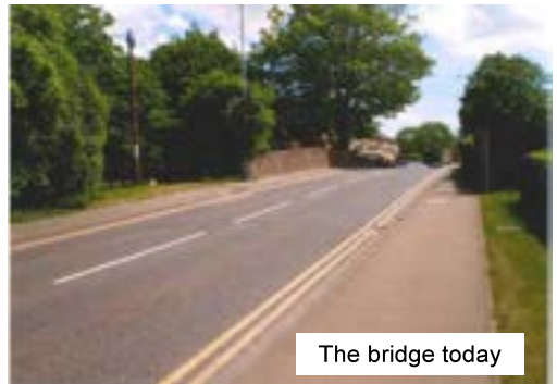
The bridge today

It later became apparent that there was a hidden agenda on the part of the Government of the day as it emerged that much of the route was to be occupied by the London Orbital Road which went on to become the M25. So, sadly, it is no longer possible to change at Dunton Green for Westerham and our bridge has a new use as a pedestrian underpass.