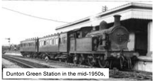
Dunton Green Station in the mid-1950s,

Many people who travel through the village may have wondered why there is a hump in the road by the school, most probably give it no thought and so continue on their way. It is, in fact, a Railway Bridge built to carry the road, which was then the A21, over the Westerham Valley Railway. Opened in 1881, it was part of an ambitious scheme to build a line through to Oxted. In the event, the line never actually got further than Westerham