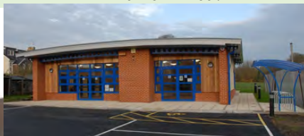
Dunton Green Pavilion

01732 22700 / communities@sevenoaks.gov.uk