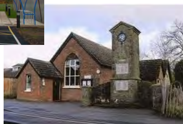
Dunton Green Village Hall

We hope you find this list of local activities and organisations useful.