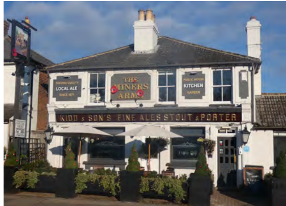
The Miners Arms in 2021!

If anyone has stories or photos relating to the history of the pub or surrounding area, it would be great to hear from them. Contact us on 01732 462214 or theminers7oaks@gmail.com