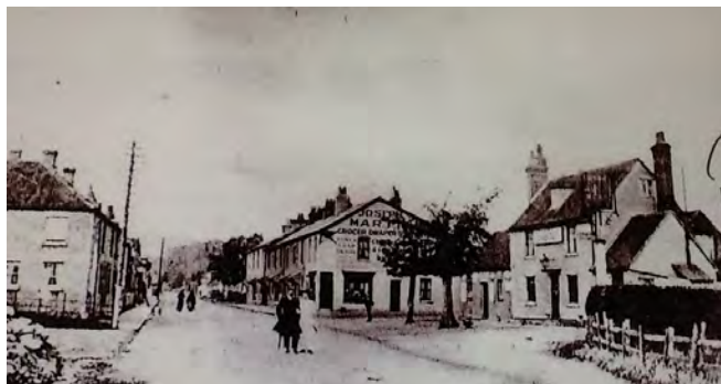
THE DUKE'S HEAD