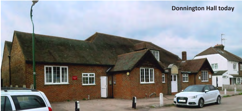
Donnington Hall today