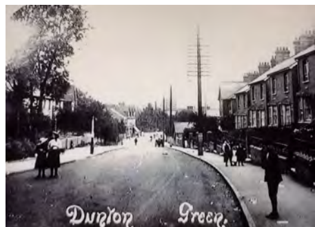
LOOKING DOWN LONDON ROAD TOWARDS THE MINERS ARMS, FROM NEAR WHERE THE MINI ROUNDABOUT IS NOW LOCATED