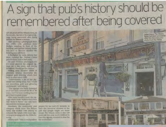
Did you see this in The Chronicle? Fascinating!