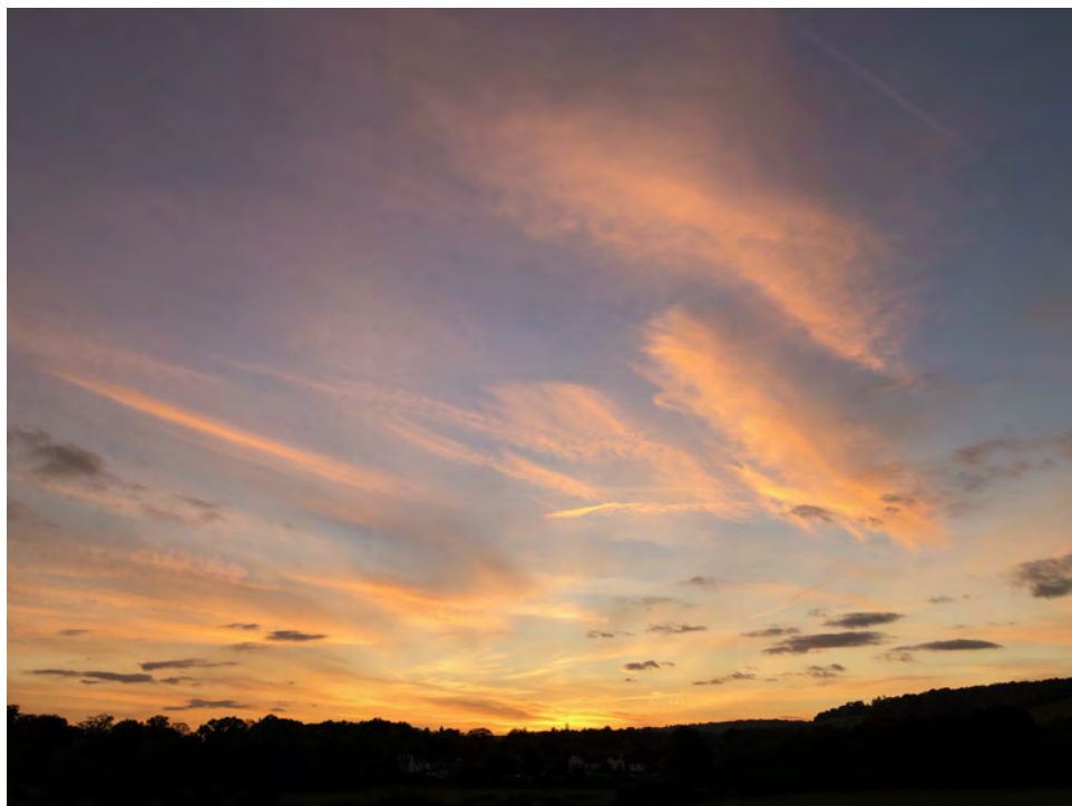
Autumn sky over Dunton Green