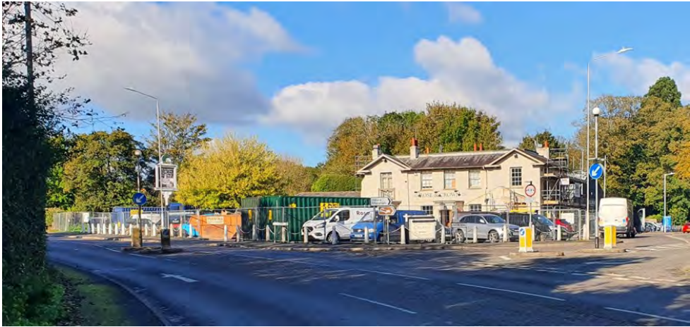
The Rose and Crown looks like It's having a big refurbishment. Hope it's open for Christmas!