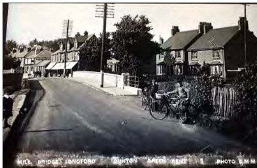
LONGFORD BRIDGE (ENTERING THE VILLAGE FROM RIVERHEAD)